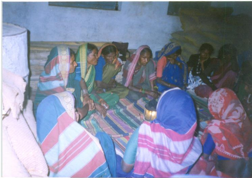
Women Conducting Group Meeting

The Women’s Development Corporation has launched a new scheme, with support from the World Bank, for women’s SHGs. Sampark has been signed on as a partner for 50 groups, mainly focussing on women’s empowerment. These have to be new groups and new villages, and not the same we formed under MASY project. It includes training, camps and exposure visits for the groups.