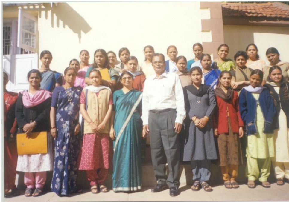
Participants in IGP Programme

FWWB has helped to promote 200 women's SHGs in Indore, who have savings and credit, but were not able to identify businesses that they could start. FWWB sent 20 representatives from these SHGs for training in business start-ups.