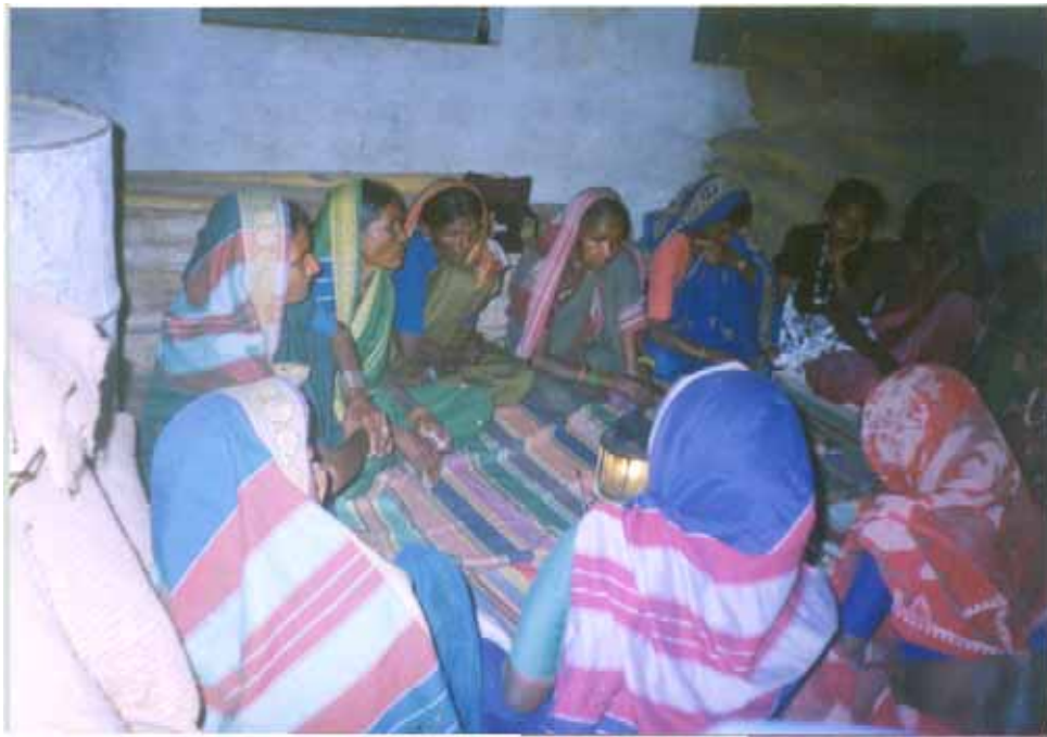
Women Conducting Group Meeting

The Women’s Development Corporation has launched a new scheme, with support from the World Bank, for women’s SHGs. Sampark has been signed on as a partner for 50 groups, mainly focussing on women’s empowerment. These have to be new groups and new villages, and not the same we formed under MASY project. It includes training, camps and exposure visits for the groups.