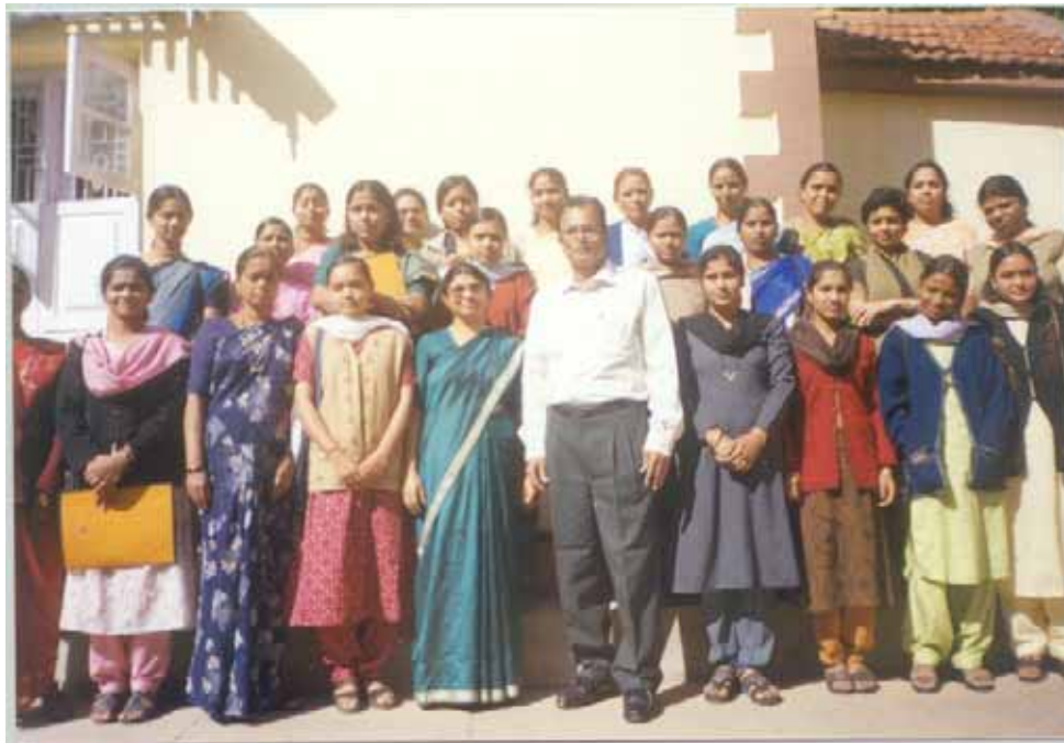
Participants in IGP Programme

FWWB has helped to promote 200 women's SHGs in Indore, who have savings and credit, but were not able to identify businesses that they could start. FWWB sent 20 representatives from these SHGs for training in business start-ups.